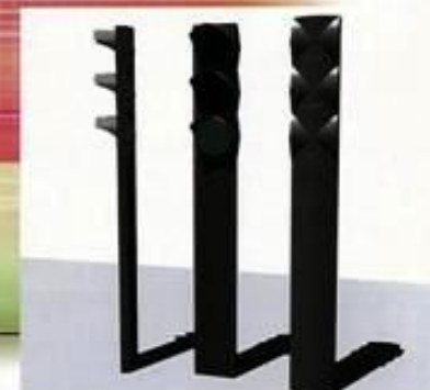
New Housing CUBIT

Besides the development of traffic lights, our company has a dedicated research and development system with experts in wide areas from measuring the strength of structures such as traffic light poles to design.